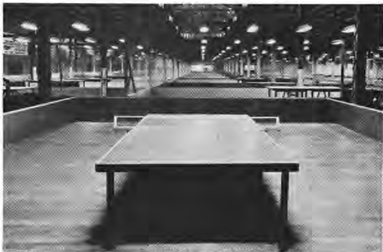
No! This is not an interior shot of the Barnet Centre but the Table Tennis Centre of Victoria, H.Q., of the Victorian T.T. Association, situated in Albert Park, Melbourne, Australia. Open every day of the week, the centre boasts 41 tables, snack bar, changing rooms and hot showers. It is the largest table tennis centre in the world.

So if you are holding some certificates, do not throw them away but ask your League or Club to join the Scheme and who knows, the Master Points Tournament next season could be giving some worth-while prizes. At the very least there is that £10 waiting for someone with only 250 points!